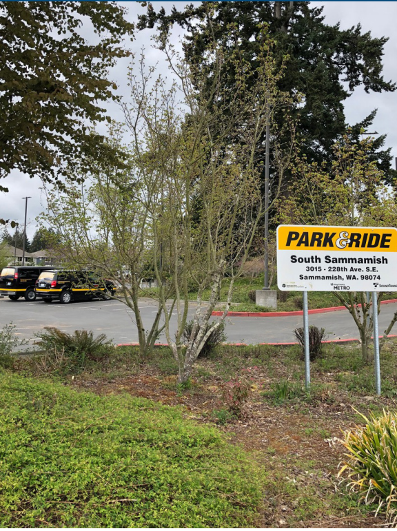
SUSTAINABLE SAMMAMISH | 7