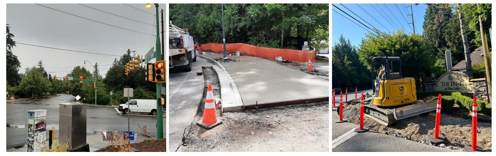
10 | PUBLIC WORKS PROJECT UPDATES

Finally, traffic signals and lights were repainted on Southeast 30th Street along the South Sammamish Park & Ride and the intersection with 228th Avenue Southeast.