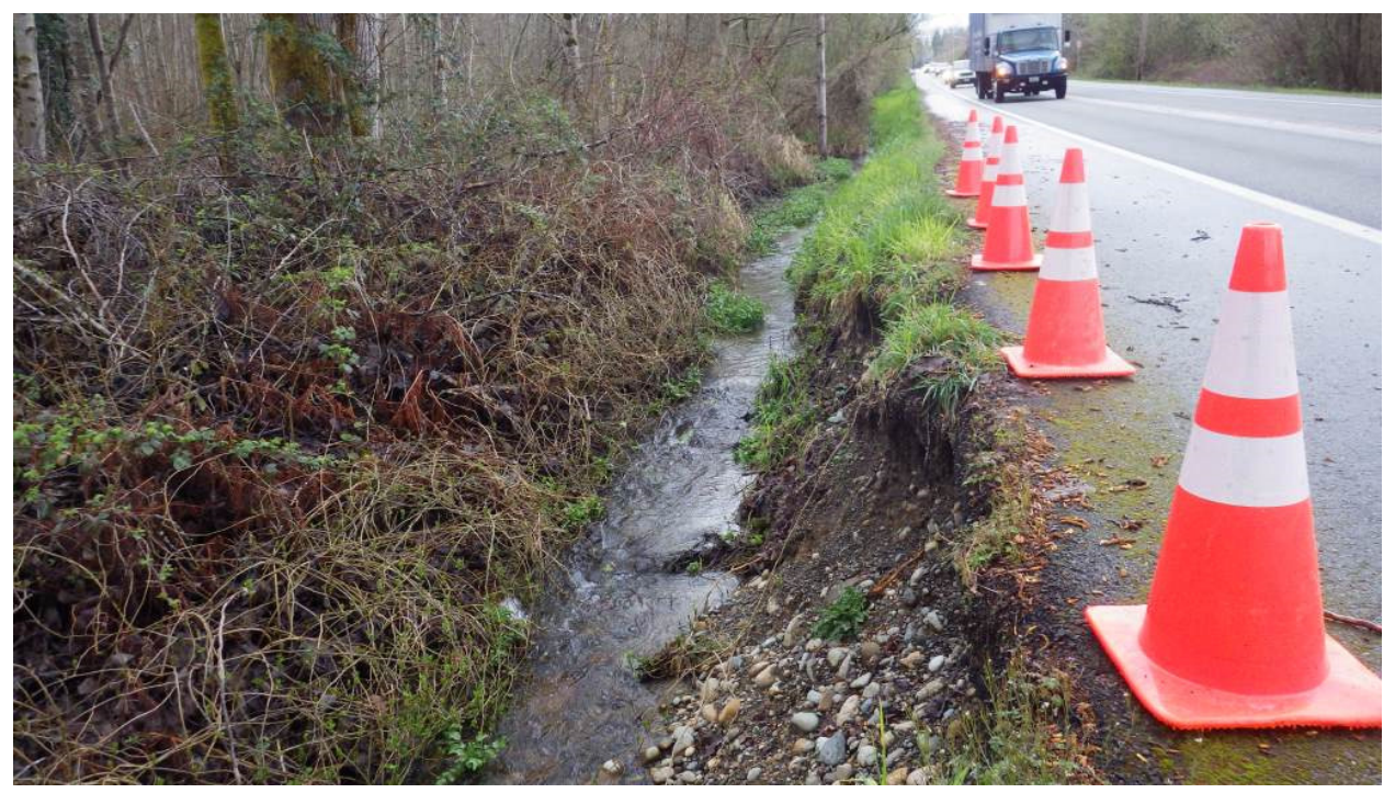
Erosion is occurring along approximately 30 feet of the stream channel.