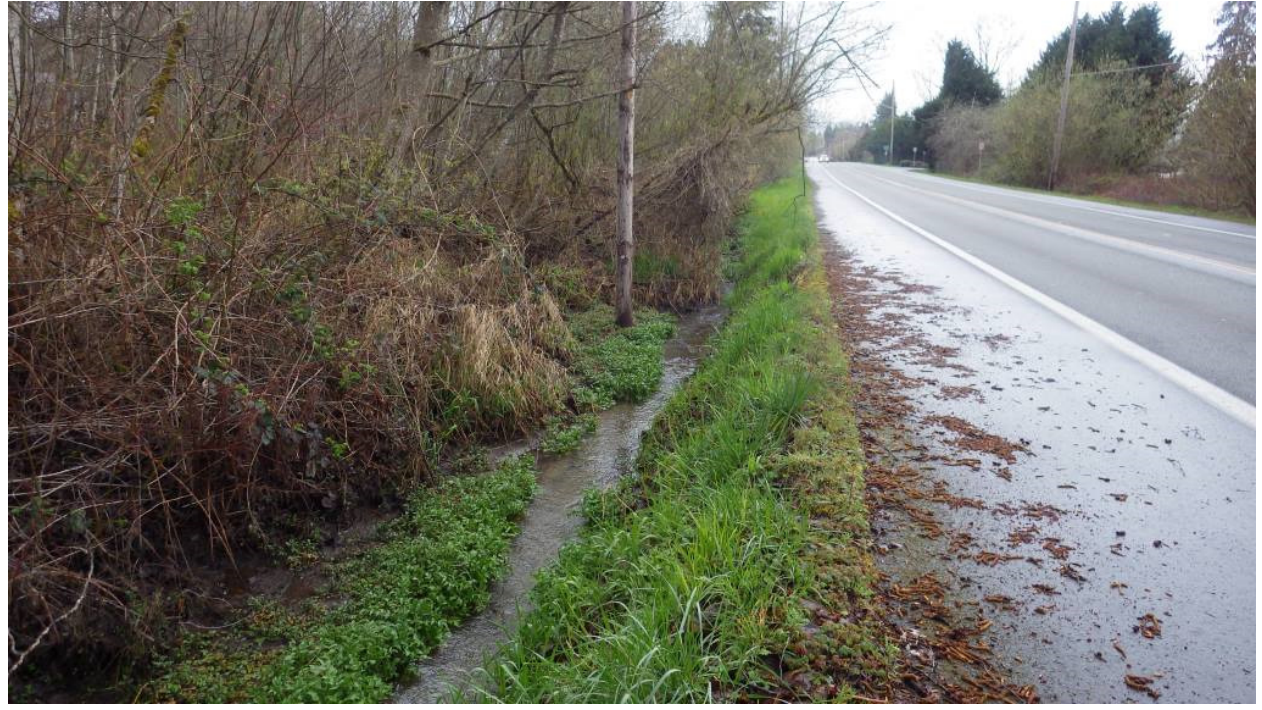
oversteepened bank extends upstream