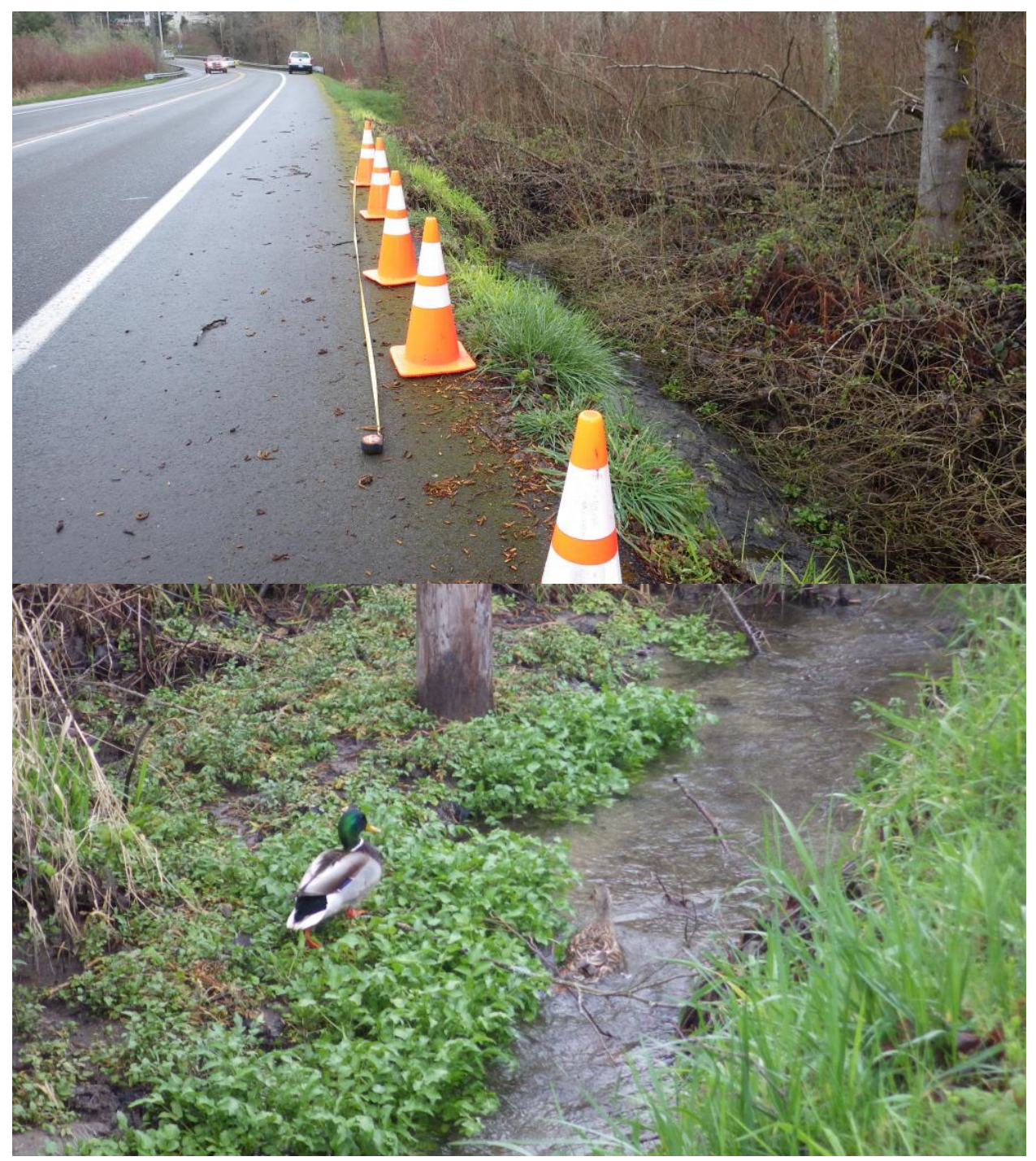
mallards, deer and fish observed during site visit