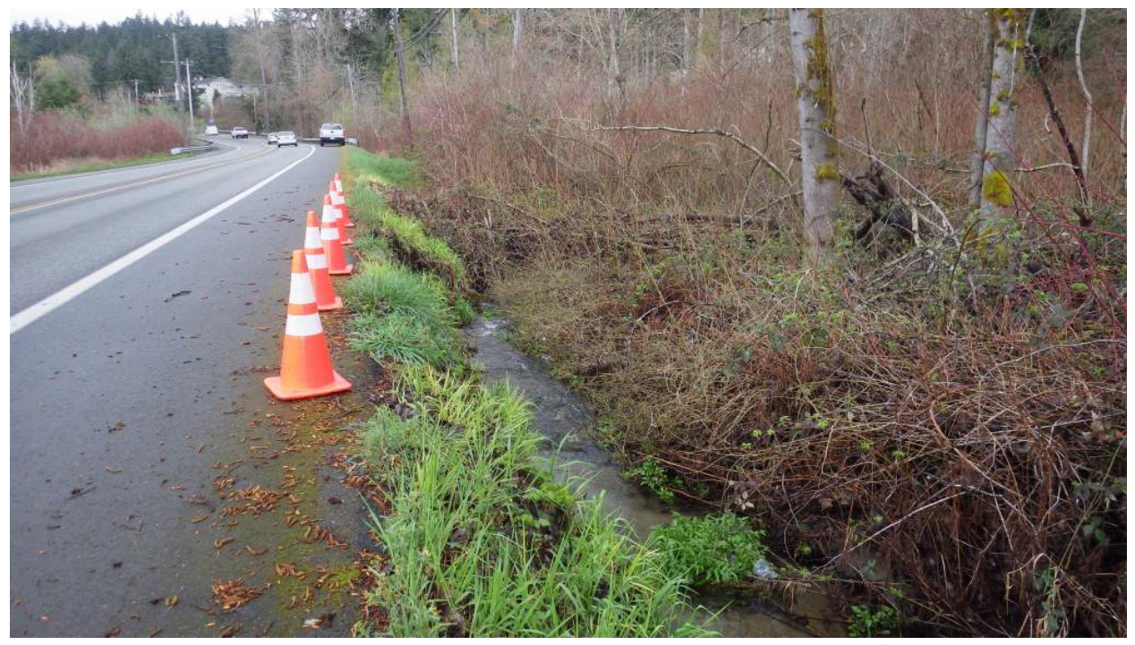
looking downstream towards ELSP culvert entrance (stream turns 90 degrees left/west)