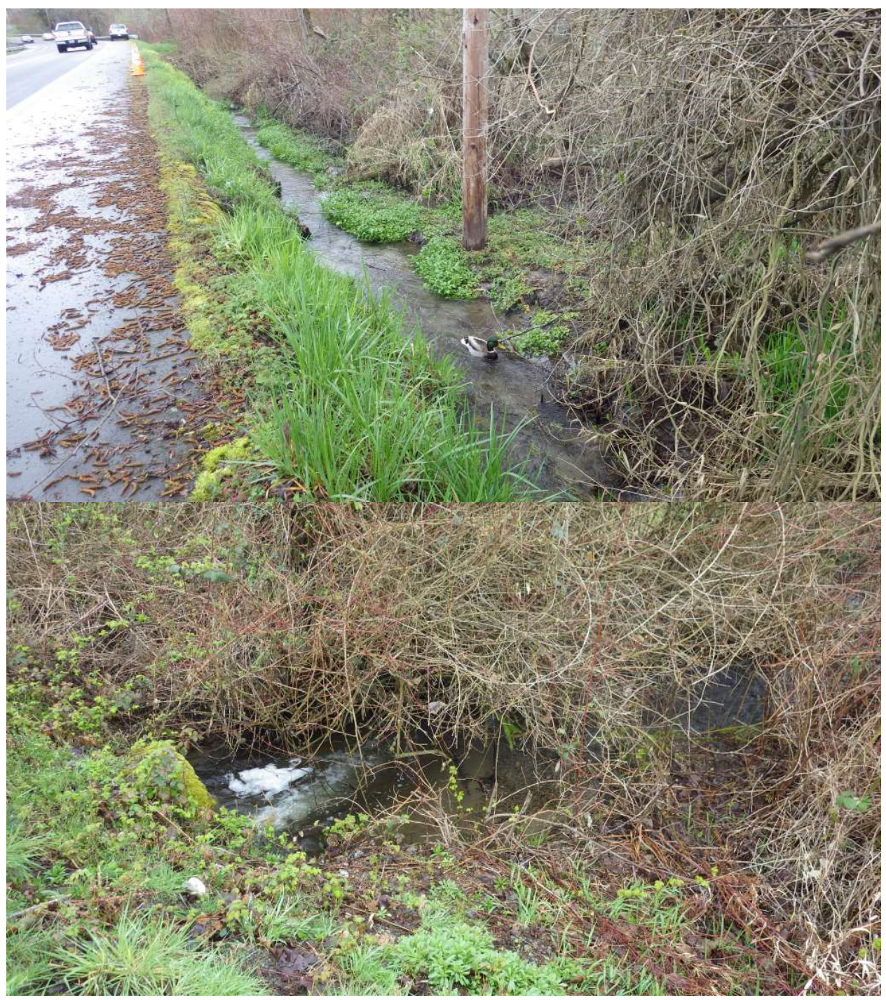
culvert downstream of ELSP