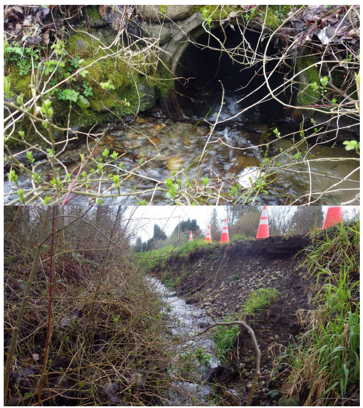
erosion is approximately 6 feet upstream from culvert entrance