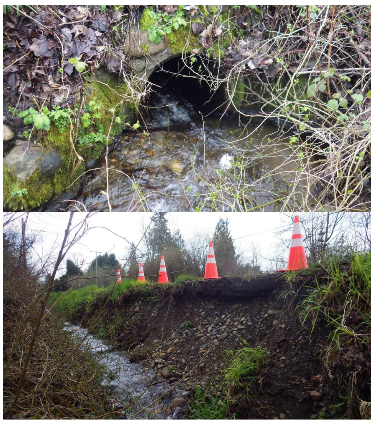
approximately 7 feet of asphalt is exposed; maximum undermine in center is 6 inches