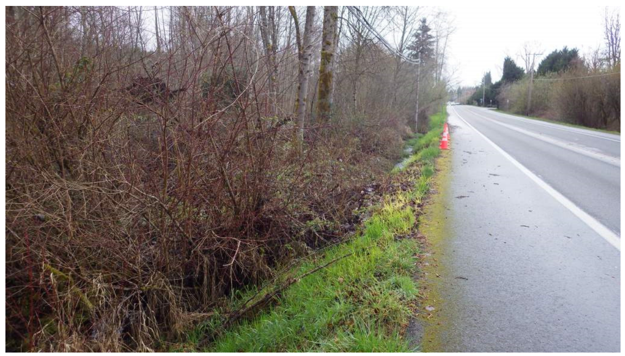
Zackuse Creek looking upstream (south on East Lake Sammamish Parkway; ELSP)